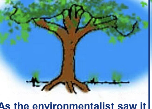
As the environmentalist saw it