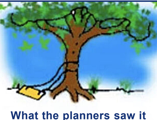
What the planners saw it