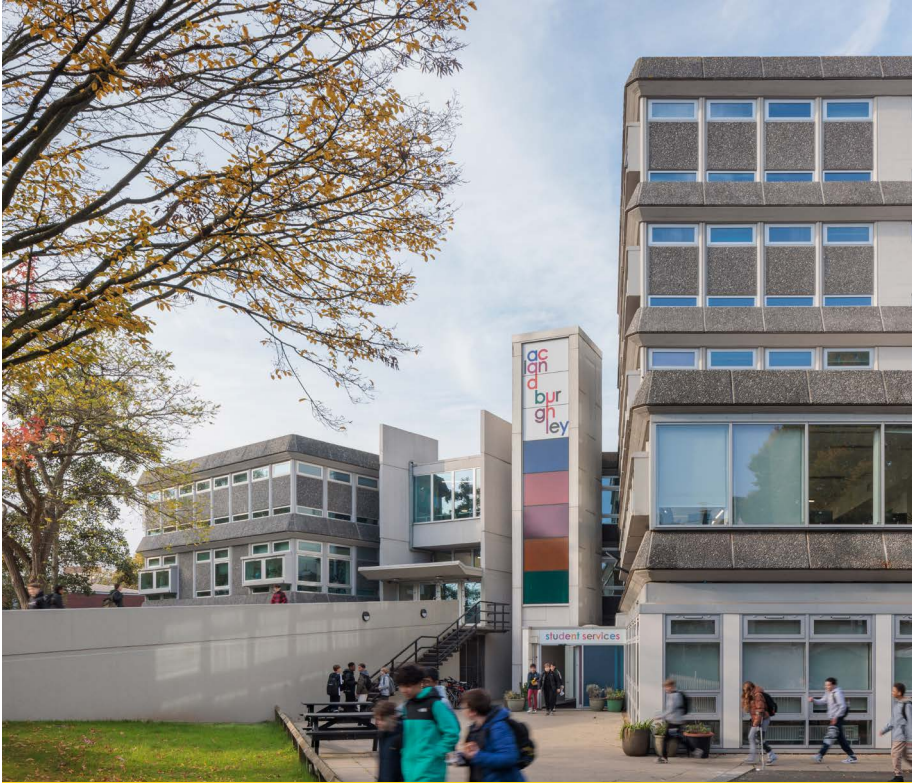
Acland Burghley School, London

The retrofit of Acland Burghley School exemplifies how thoughtful design can breathe new life into a Brutalist structure. By respecting the building's architectural heritage and integrating modern educational