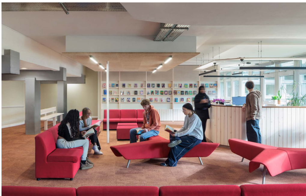
Acland Burghley School, London

Classrooms have been upgraded to foster a conducive learning environment. Dropped ceilings